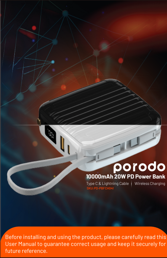
porodo 10000mAh 20W PD Power Bank Type C & Lightning Cable | Wireless Charging SKU: PD-PBFCH041

Before installing and using the product, please carefully read this User Manual to guarantee correct usage and keep it securely for future reference.